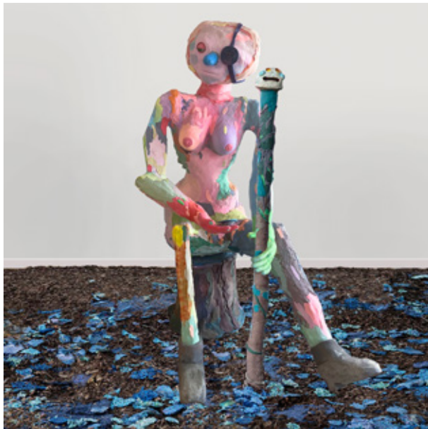
Changeling mixed media, 146 x 84 x 80 cm