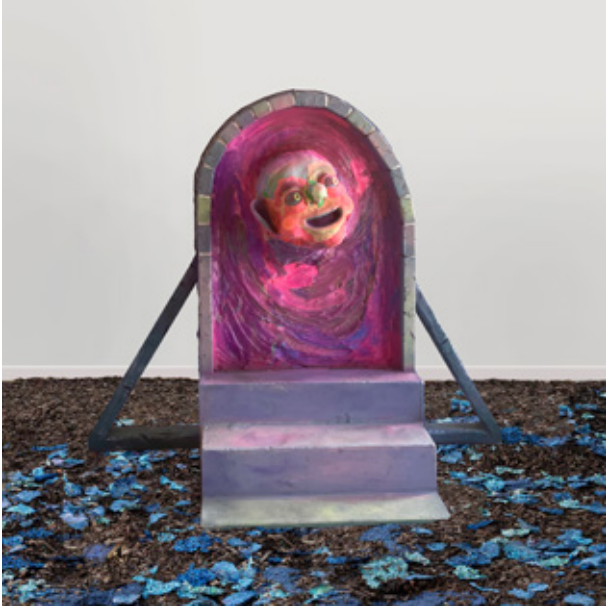
Threshold mixed media, 110 x 130 x 43 cm