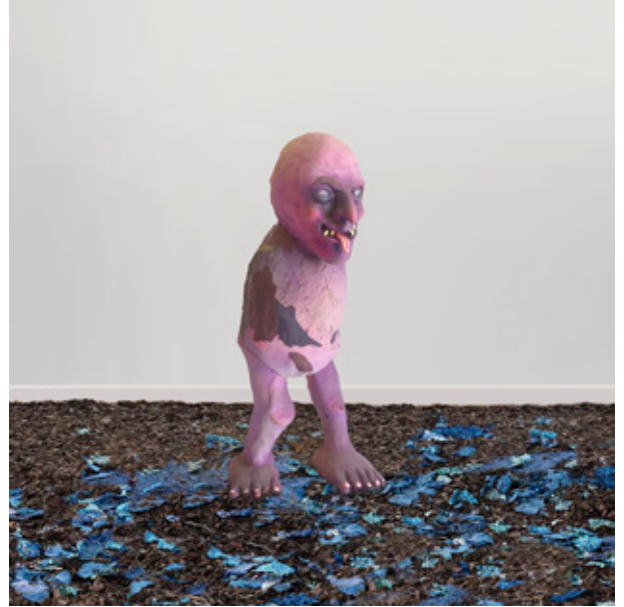
Purple Sprite mixed media, 72 x 45 x 31 cm