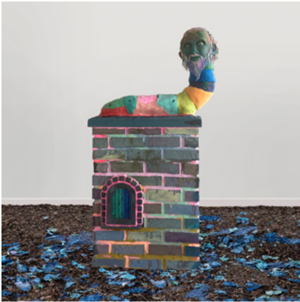
Worm on Wall mixed media, 162 x 83 x 26 cm