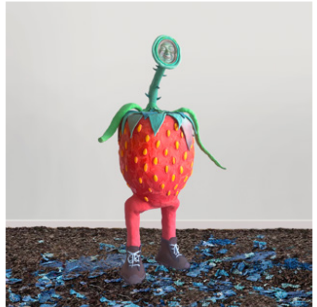
Strawberry Sprite mixed media, 113 x 56 x 84 cm