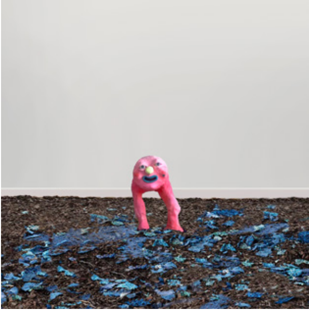
Happy Face mixed media, 35 x 34 x 22 cm