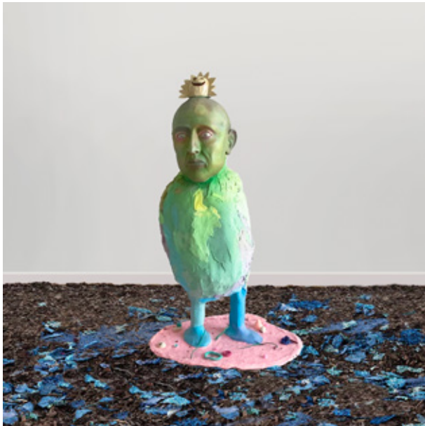
Sunburst Sprite mixed media, 85 x 40 x 38 cm