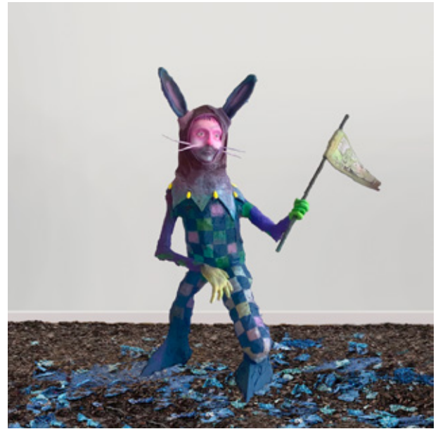
Rabbit mixed media, 129 x 110 x 52 cm