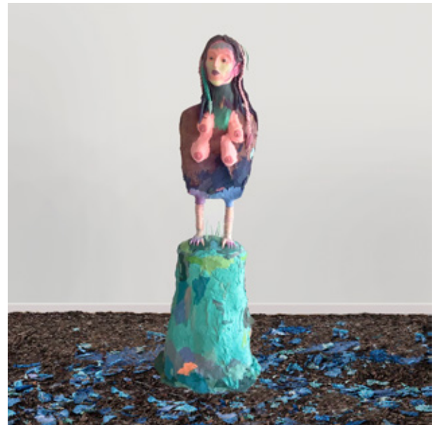
Talons mixed media, 178 x 57 x 47 cm